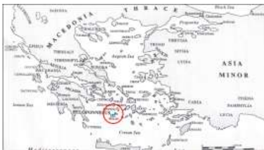
Melos island and Classical Greece (from: On the Origins of War di Donald Kagan)

The Athenians do not believe in the Meli (they believe that neutrality would have favored the Spartans) and affirm that the force of arms is the only weight in relations between states.