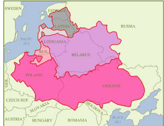
Polish-Lithuanian Commonwealth in 1618. Behind the current geopolitical situation.

The Polish will could be moved by historical memory aimed at reconstructing an area of influence, similar to the one indicated in the figure, which extended almost to the Black Sea. An interest of this type could be justified by the Polish vulnerability due to its geographical position, placed at the center of Western dynamics of German origin and Eastern dynamics of Russian origin.